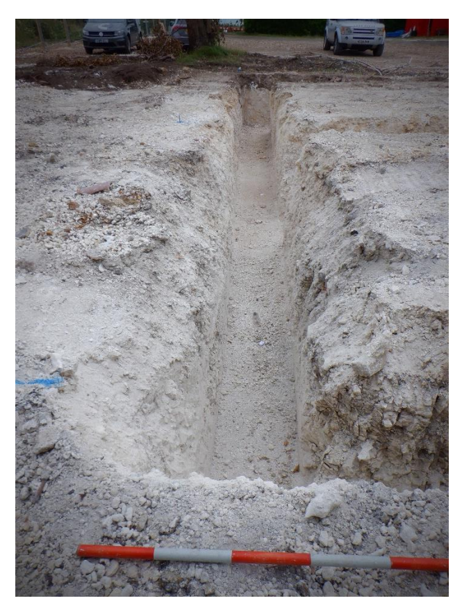
Plate 6. Foundation trenches (looking West)