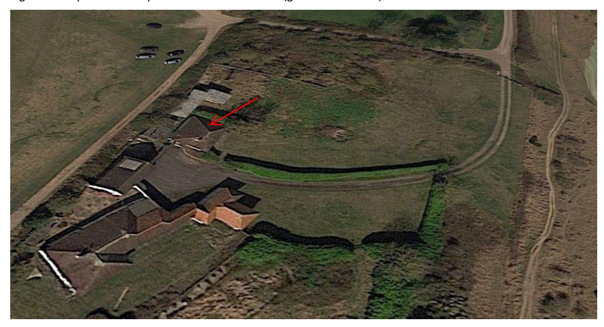
AP 1. Area prior to redevelopment -red arrow (Google Earth 2021)