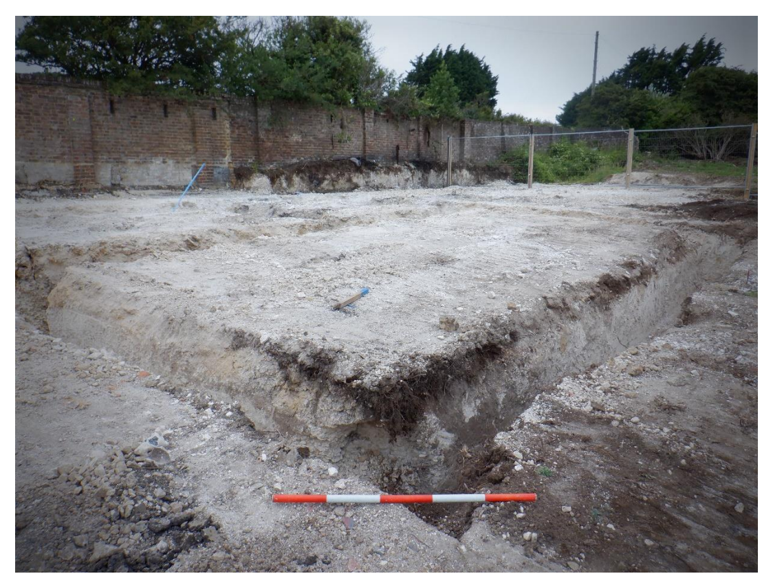
Plate 5. Foundation trenches (looking NNE)