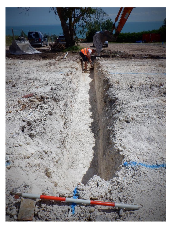
Plate 2. Measuring in foundation trenches (looking East)