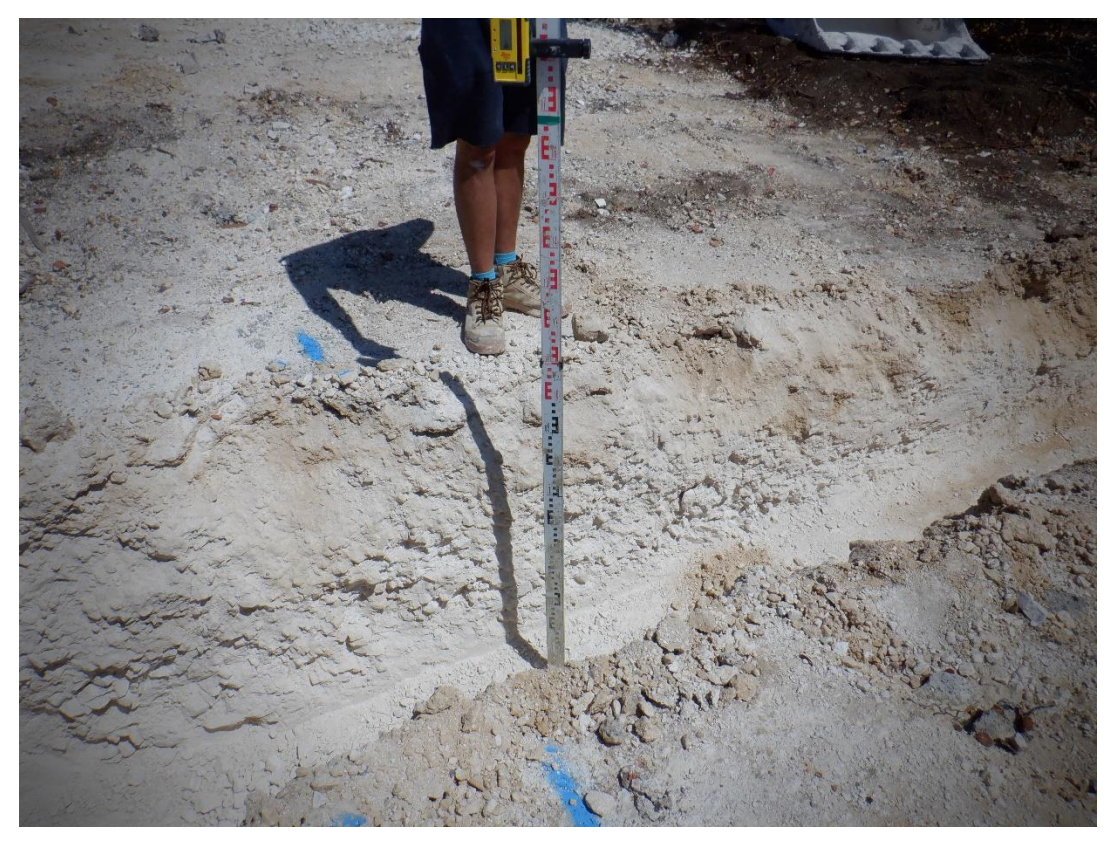
Plate 4. Prepared surface with foundation trenches marked out (looking NE)