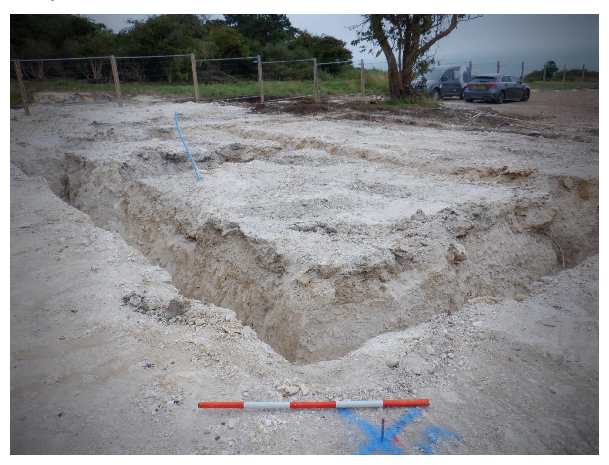
Plate 1. Cutting foundations and surfaces but leaving existing services (looking NE)