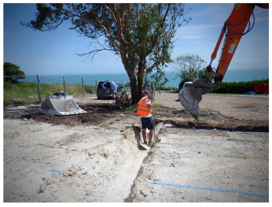
Plate 3. Foundation footing (looking NNE)